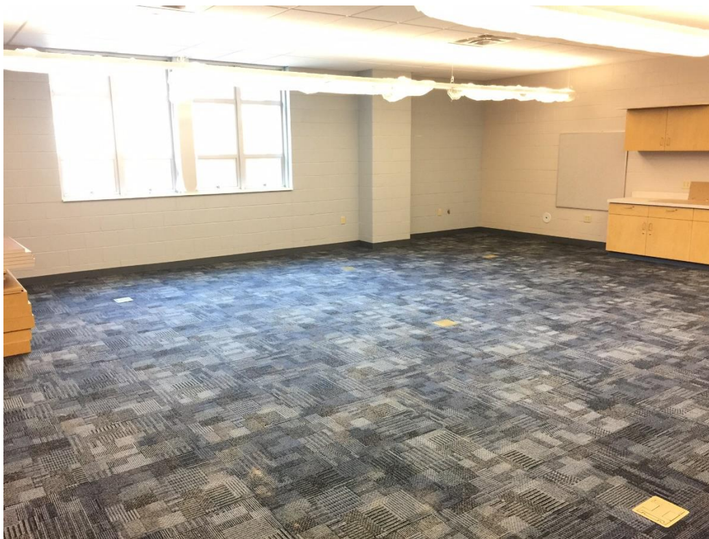
Carpet in STEM room