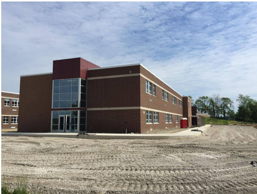
Stone sub base